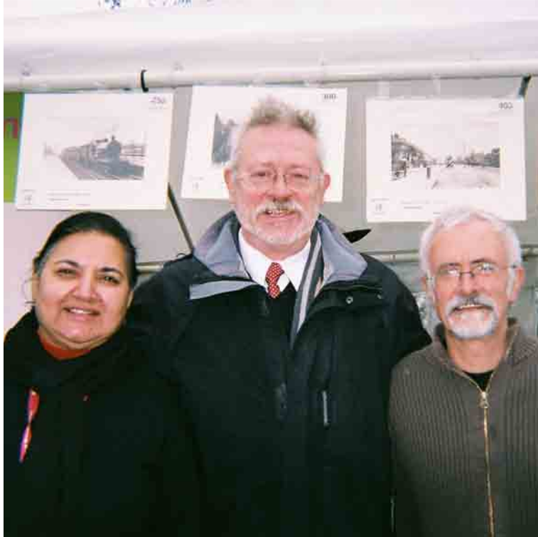
Your Councillors at Our Community Festival September 2010

We join in, sit down, listen to and talk with the community in